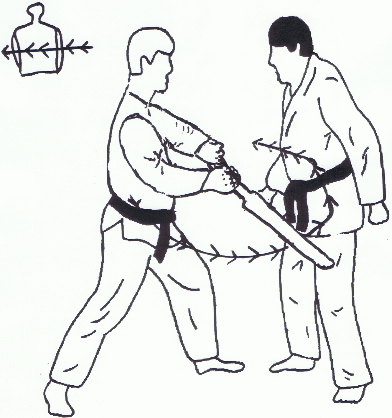
SIDE STRIKE ACROSS THE BODY