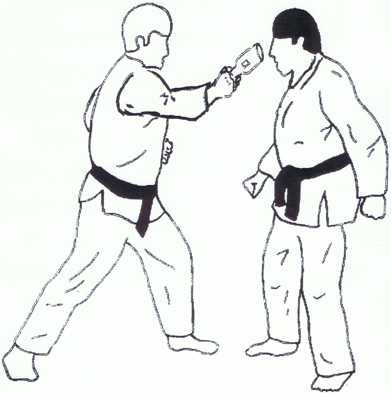
RIGHT BOTTLE THRUST TO FACE