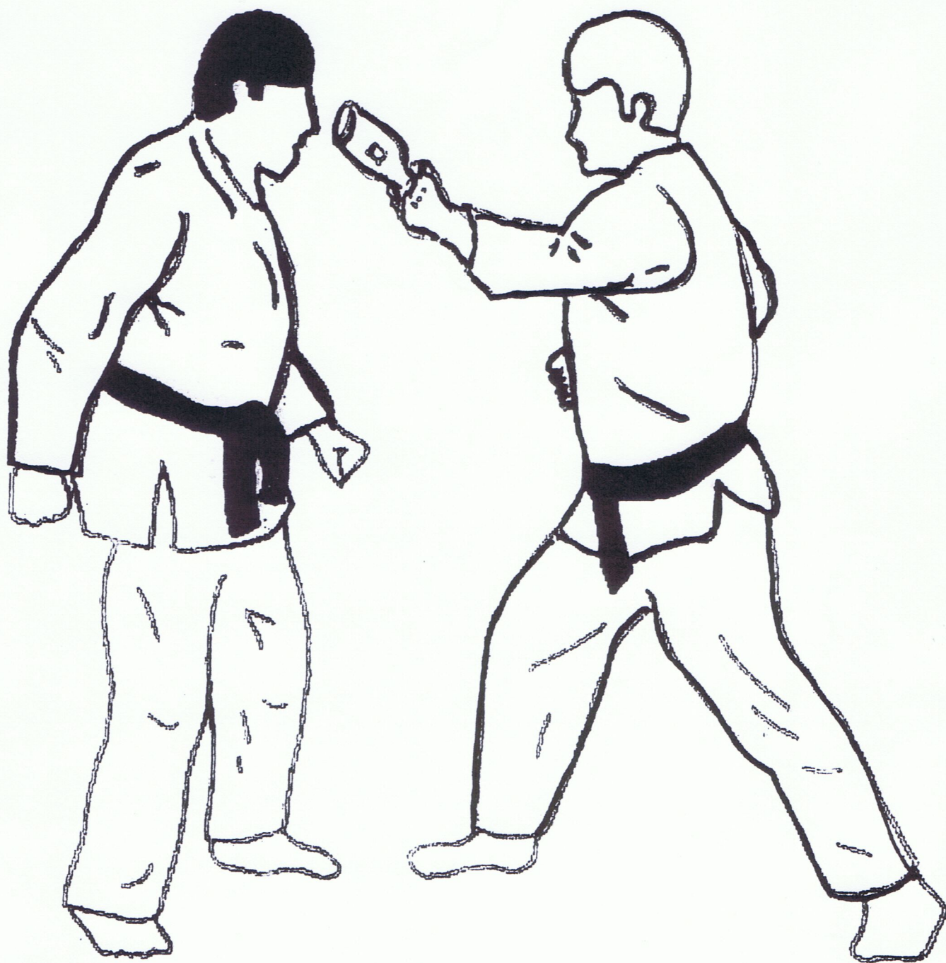
LEFT BOTTLE THRUST TO FACE