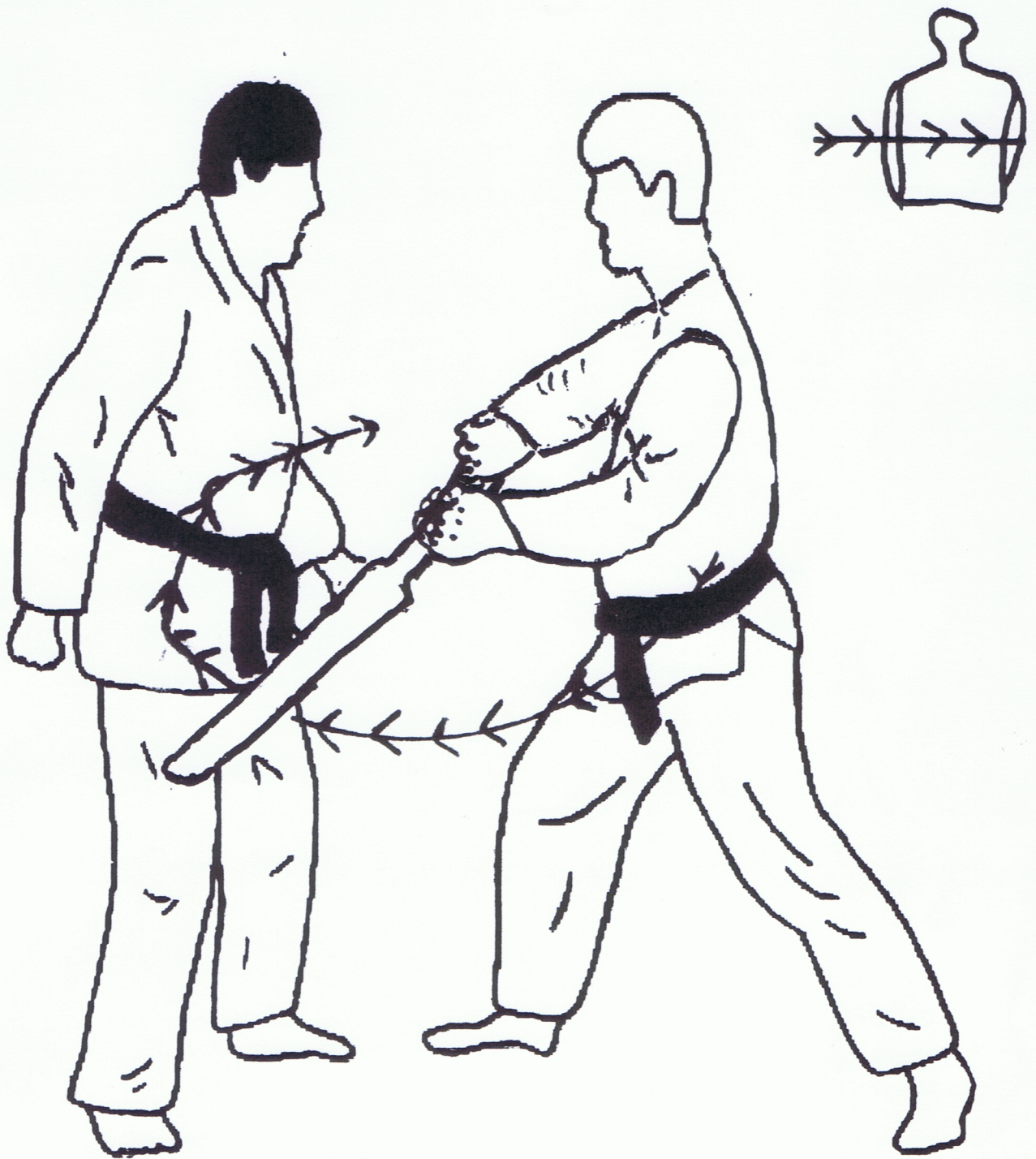
SIDE STRIKE ACROSS THE BODY