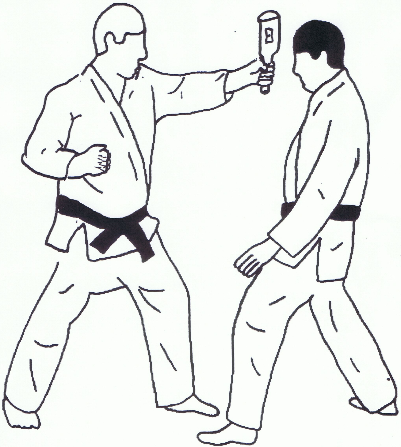
LEFT DOWNWARD BOTTLE TO TOP OF THE HEAD