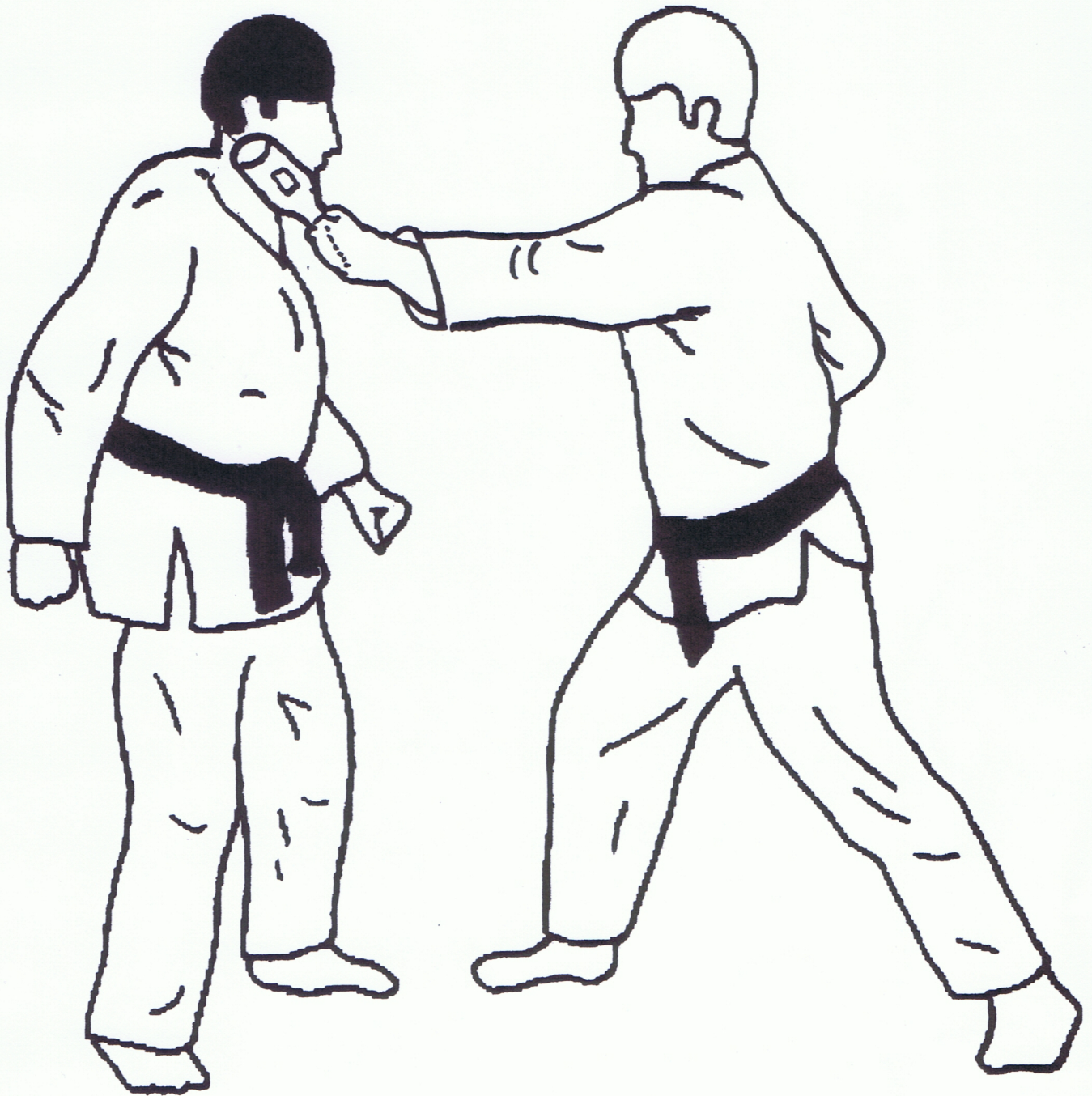
LEFT BOTTLE SLASH TO NECK